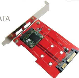
half size mSATA