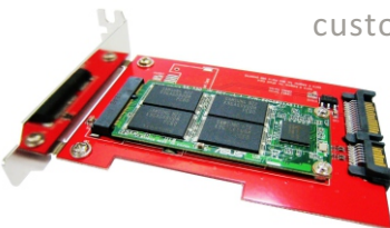
custom size mSATA