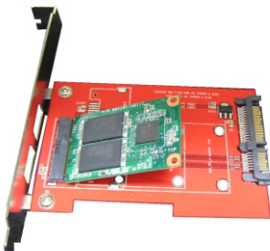
full size mSATA